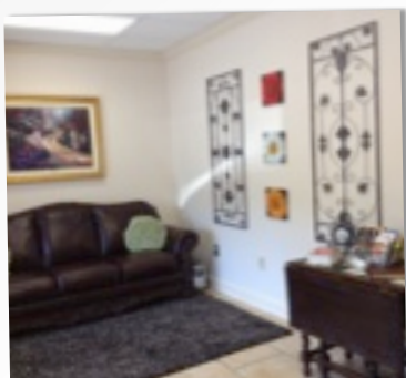
MEETING & WAITING AREA

After a summer filled with packing and unpacking, setting up a new playroom, and organizing the various offices, it is now time to welcome new and existing clients and families. Ongoing services include counseling for individuals, groups, children, teens and adults!!