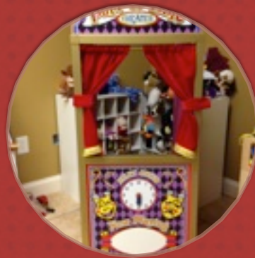
Bibliotherapy & Family Resources