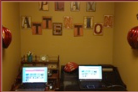
Play Attention Neurofeedback Training Room